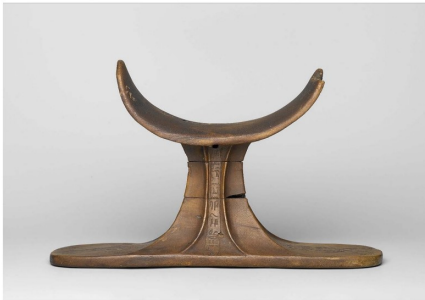
History of cushions