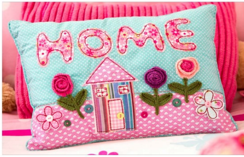
Aesthetically pleasing and functional