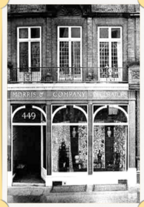
Arts and Crafts movement

William Morris, and others like him, didn't approve of the mass-produced art that was the result of the industrialised Victorian society. The Arts and Crafts movement, which he founded, favoured a return to skilled workmanship and high quality goods instead of machine-made items. In 1861, William Morris set up his own company along with a few other artists. They produced furniture, wallpaper, textiles (such as cushions and curtains) and jewellery. The Arts and Crafts movement became very popular, although it was mainly the middle and upper classes who could afford the hand-made pieces.