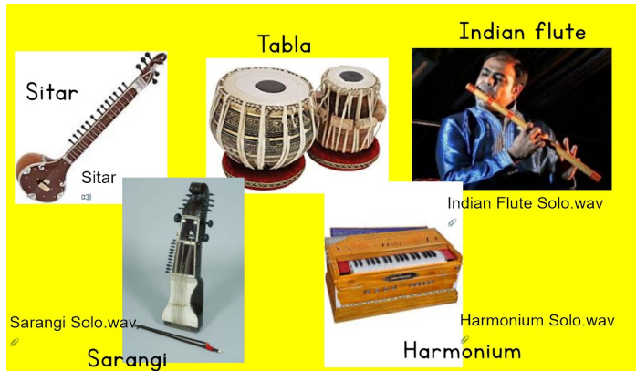
Indian Musical Instruments