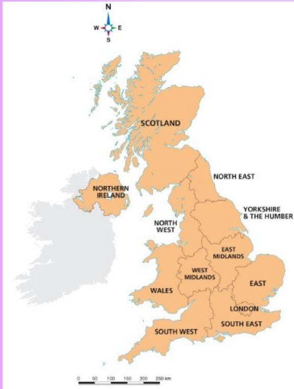
Map of UK regions