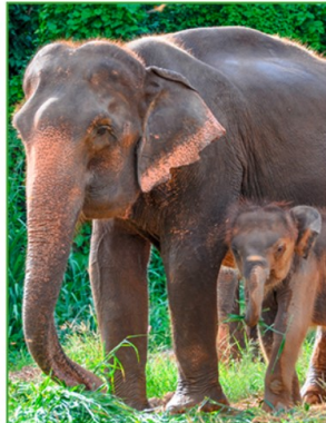
Asian elephant 92 weeks