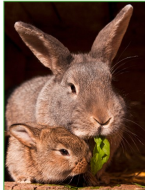
Rabbit 5 weeks