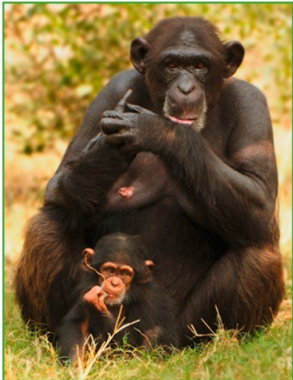
Chimpanzee 32 weeks