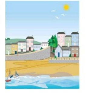
en la costa