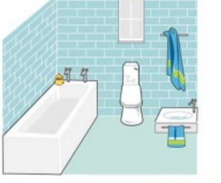
un cuarto de baño